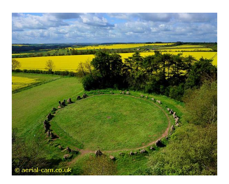
The Ring of Stones

Read the following text about the Rollright Stones, and do the related exercises below.